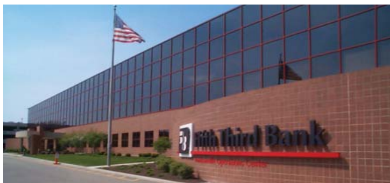
The Grand Rapids Data Center is a production-level facility that supports FTPS' dial authorization network and host-to-host merchant authorization systems. This data center also provides network support for gateway processing clients requiring credit, debit and EBT network access and is a full hot-site disaster recovery facility for our ATM and related EFT processing.