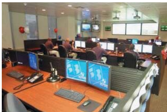
The EFT processing applications are developed and supported, 24x7, by FTPS in-house programming staff. The applications have been designed, developed and refined over the years to handle the most demanding processing requirements.